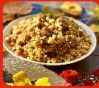
MIDDLE EASTERN PILAF