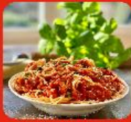
ITALIAN PASTA SAUCE