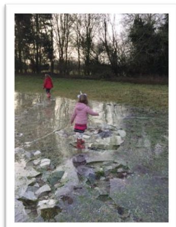
Isla and Honor on a winter walk and watching raisins in lemonade.

photos if you can. Check out the school website to see what everyone has been up to. If your children haven't tried to do any of them yet, why don't you take a look this weekend? Many of them are very easy to do using everyday items you might have in the house. There is a copy of the booklet with all the activities in available to download from the school website under Curriculum/Science. Alternatively, ask at the school office for a copy.